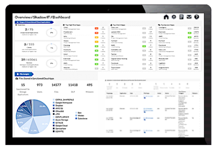
FortiCASB Shadow IT Dashboard

FortiCASB has seamless integrations with FortiGate and FortiAnalyzer to provide a comprehensive view of the risk posture and usage for all sanctioned and unsanctioned (Shadow IT) cloud applications used in an organization, enabling administrators with insights to enforce policy-based access controls for risky applications.